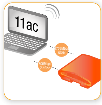
Blinding Fast 4-Stream 802.11ac