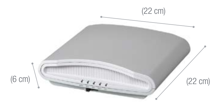
weight is 1.1 kg. (2.3 lbs.)