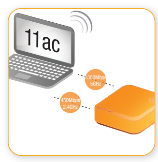
Blinding Fast 3-Stream 802.11ac